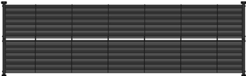
VIBEA 3X1 Collector Image

This manual contains basic information about solar collectors and their accessories, as well as important installation instructions and tips, according to our standards.